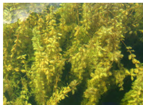
Eurasian milfoil ( Myriophyllum spicatum )

Exotic plant species that are currently a threat to Michigan lakes include Eurasian milfoil ( Myriophyllum spicatum ), starry stonewort ( Nitellopsis obtusa ), hydrilla ( Hydrilla verticillata ), and phragmites ( Phragmites australis ). Eurasian milfoil, starry stonewort, and hydrilla are submersed species, meaning that they grow underwater, and phragmites is an emergent plant that grows along the water's edge.