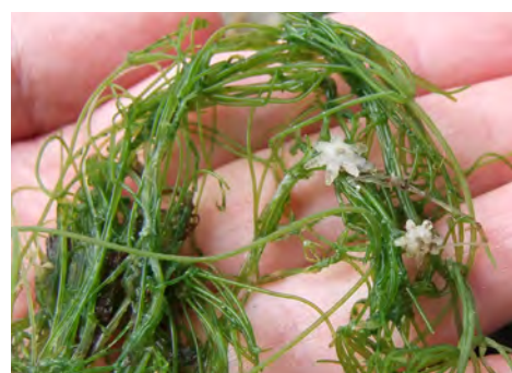
Starry stonewort ( Nitellopsis obtusa )