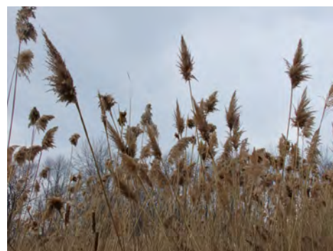
Phragmites ( Phragmites australis )