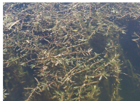
Curly-leaf pondweed ( Potamogeton crispus )